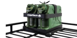
Water Can Holder