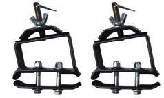
Hi-Lift mount for 5" height Racks