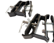
Axe and Shovel for 5" height Racks