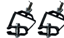
Hi-Lift mount for 3" height racks