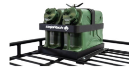
Water Can Holder