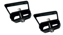
Awning mount for 3" height racks (2 pieces)