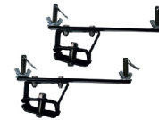
Maxtrax mount for 3" height racks