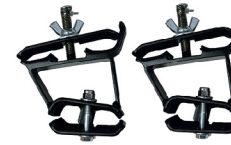
Axe & Shovel mount for 3" height racks