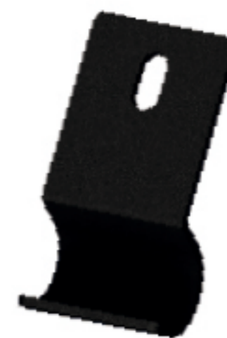
Clamp with one slot (x2)

Important: For the clamps installation is indistinct the order for the clamps. Two clamps has two holes and the other clamps has one slot. See the below image as reference.