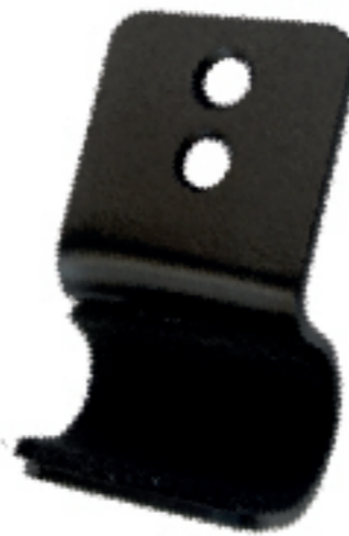
Clamp with two holes (x2)