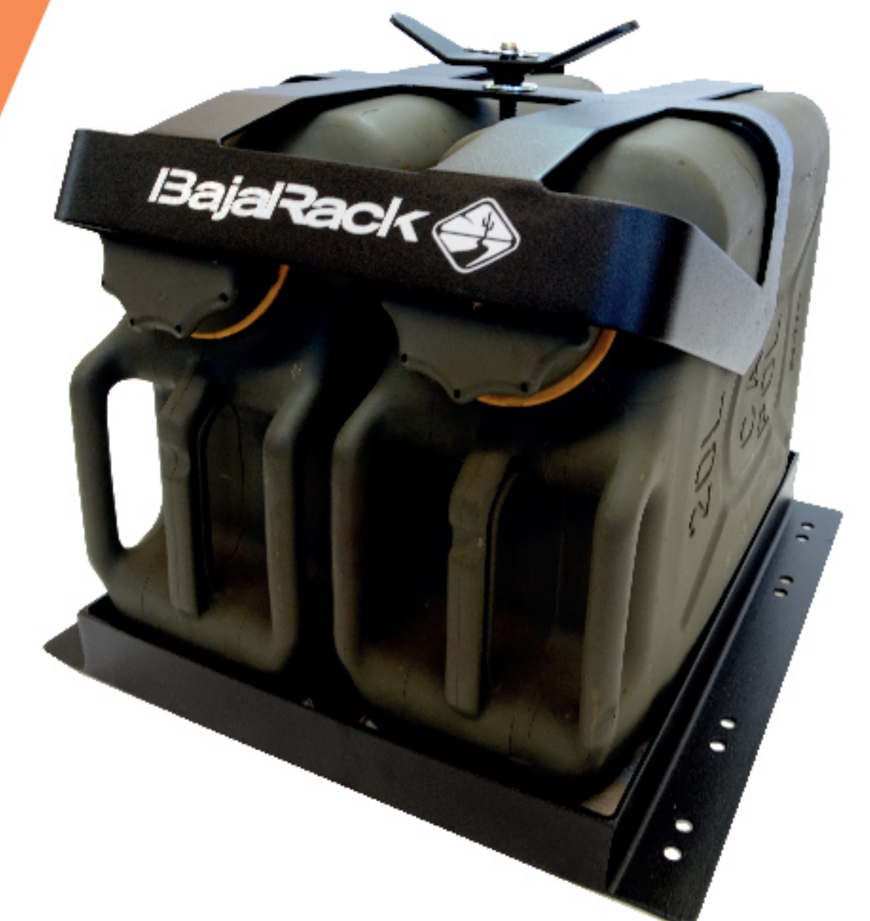
Fuel can holder LR