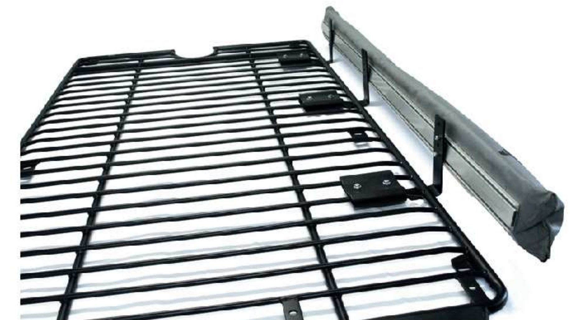
Awning mount for Flat racks