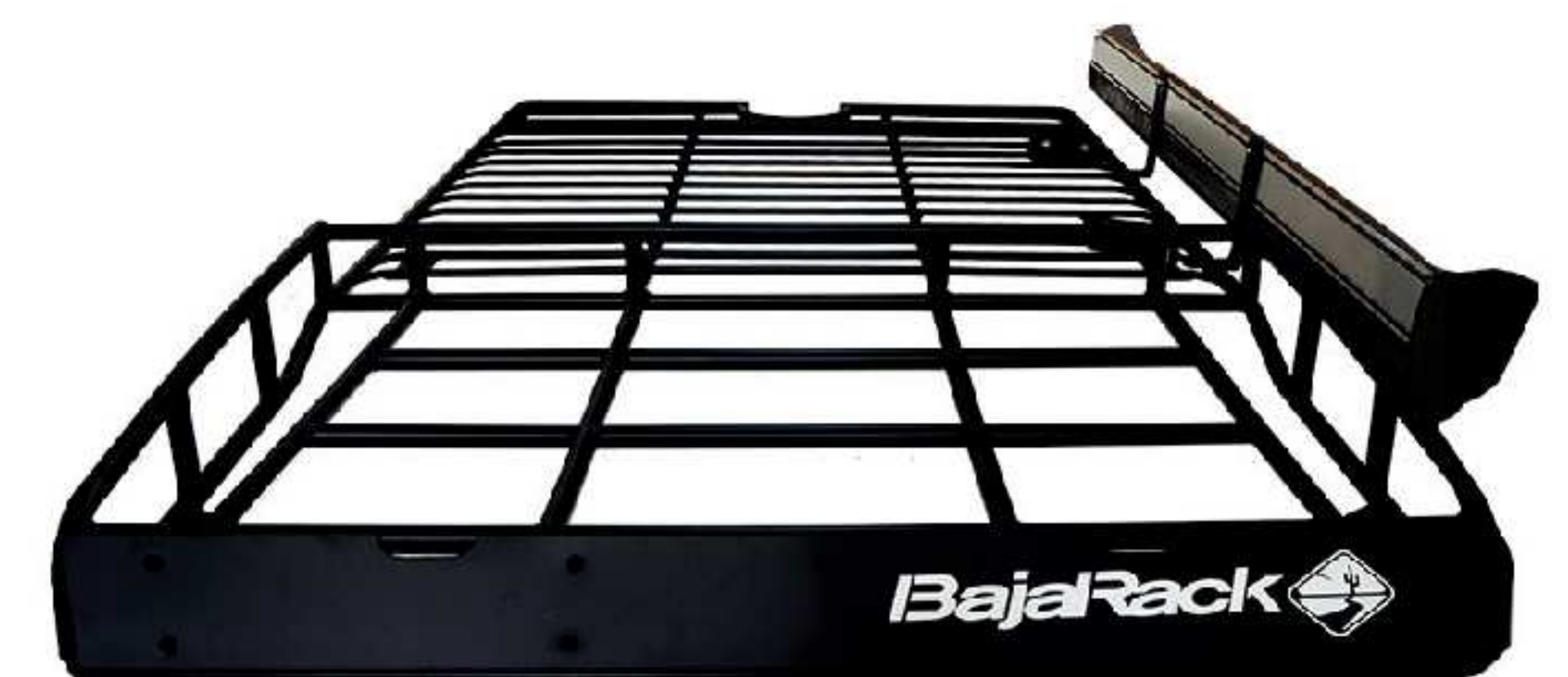
Awning mount for Flat racks