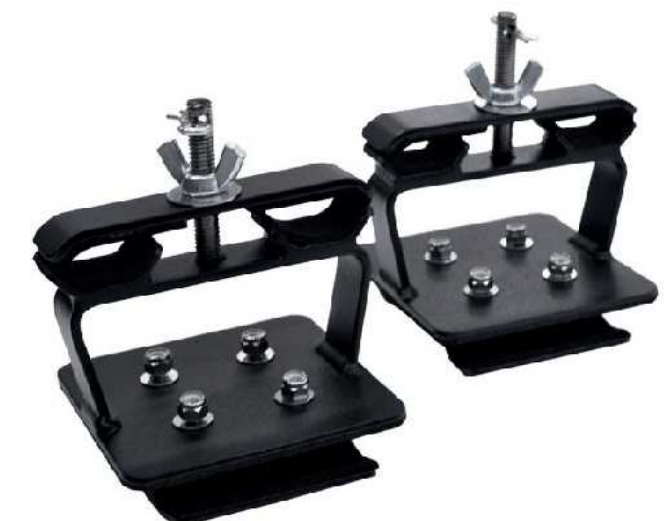
Axe & Shovel mount for Flat racks