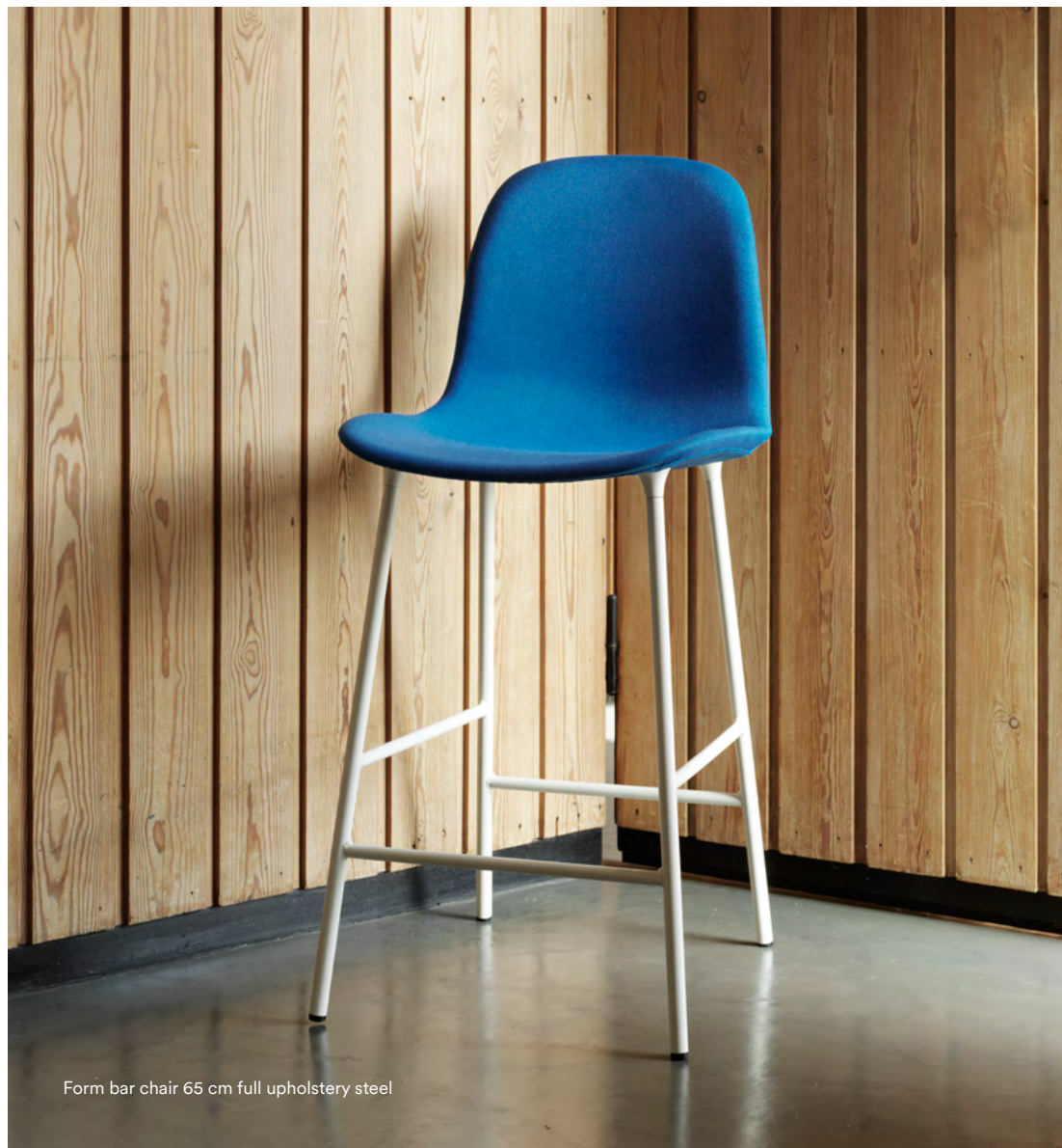
Form bar chair 65 cm full upholstery steel