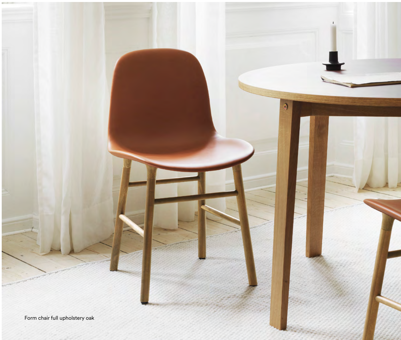
Form chair full upholstery oak