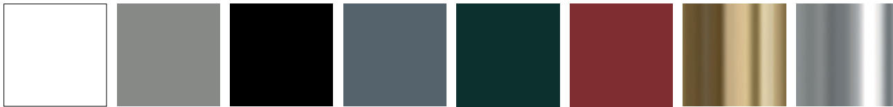
White Grey Black Blue Green Red Brass Chrome