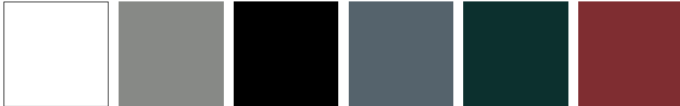
White Grey Black Blue Green Red