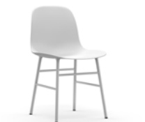
Form chair steel, chrome, brass H: 80 x L: 48 x D: 52 x SH: 44 cm