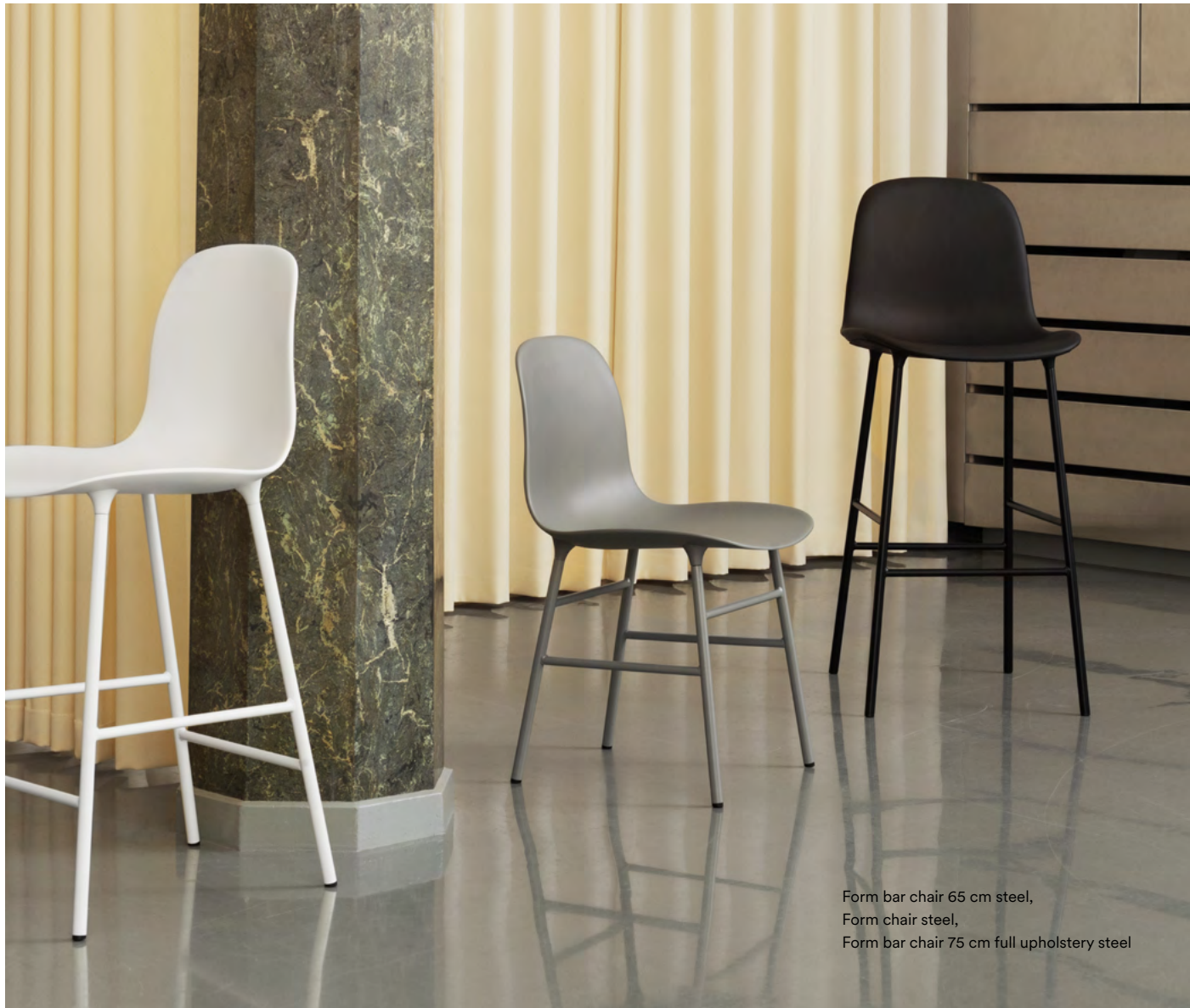
Form bar chair 65 cm steel, Form chair steel, Form bar chair 75 cm full upholstery steel