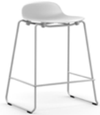
Form bar stool 65 cm stacking steel, chrome H: 77,5 x L: 58,5 x D: 45 x SH: 65 cm