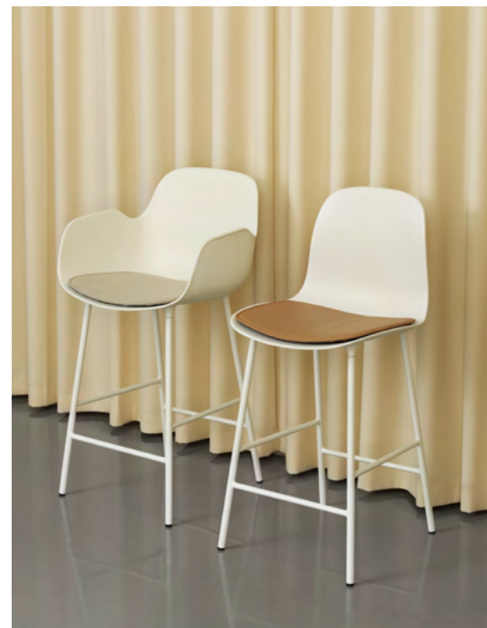
Form bar armchair 65 cm steel with seat cushion, Form bar chair 65 cm steel with seat cushion