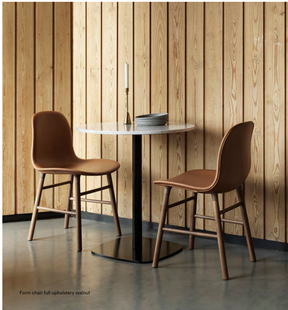
Form chair full upholstery walnut