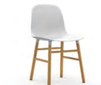
Form chair wood H: 80 x L: 48 x D: 52 x SH: 44 cm