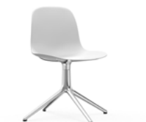
Form chair swivel 4L H: 80 x L: 70,5 x D: 70,5 x SH: 44 cm