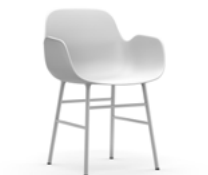
Form armchair steel, chrome, brass H: 80 x L: 56 x D: 52 x SH: 44 x AR: 66,5 cm