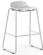
Form bar stool 75 cm stacking steel, chrome H: 77,5 x L: 60,5 x D: 48,5 x SH: 75 cm