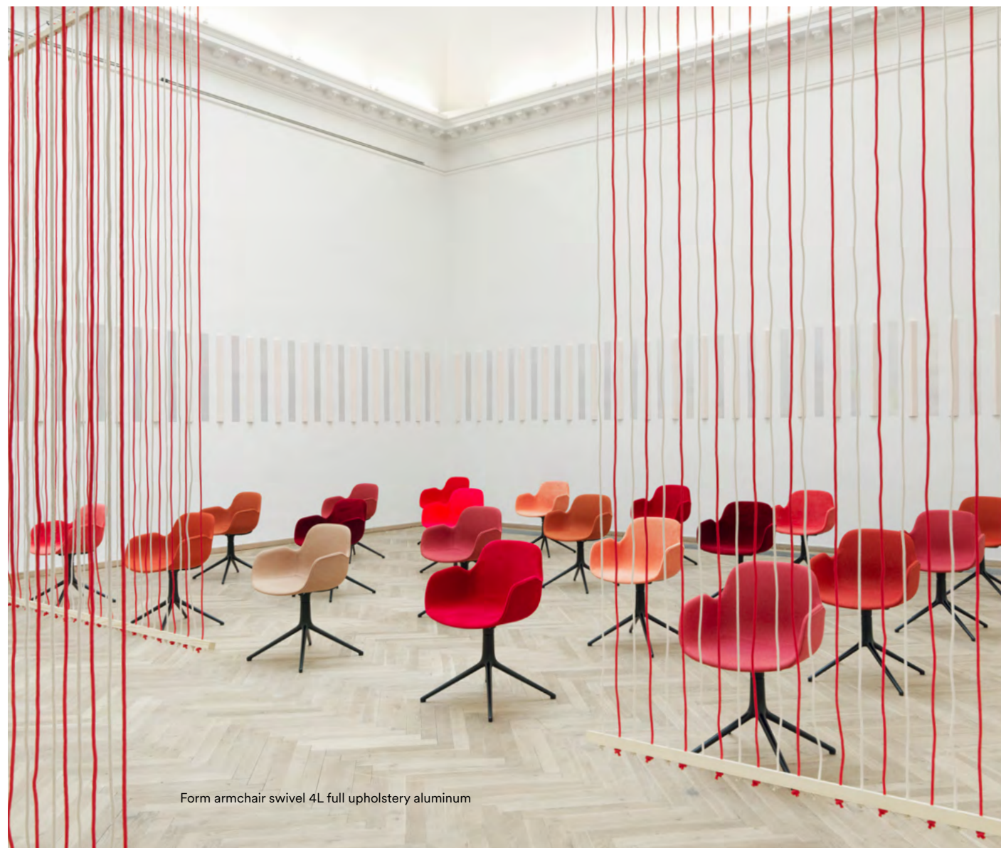
Form armchair swivel 4L full upholstery aluminum

We recommend to check and tighten screws every 3-6 months. Please make sure your choice of glides is suitable for the type of flooring. We recommend to check the glides every 3-6 months. If worn down, please replace.