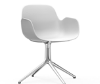
Form armchair swivel 4L H: 80 x L: 70,5 x D: 70,5 x SH: 44 x AR: 66,5 cm