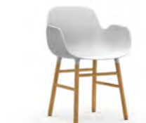
Form armchair wood H: 80 x L: 56 x D: 52 x SH: 44 x AR: 66,5 cm