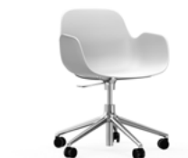
Form armchair swivel 5W gaslift H: 73/86 x L: 72,5 x D: 72,5 x SH: 37/50 x AR: 59/72 cm