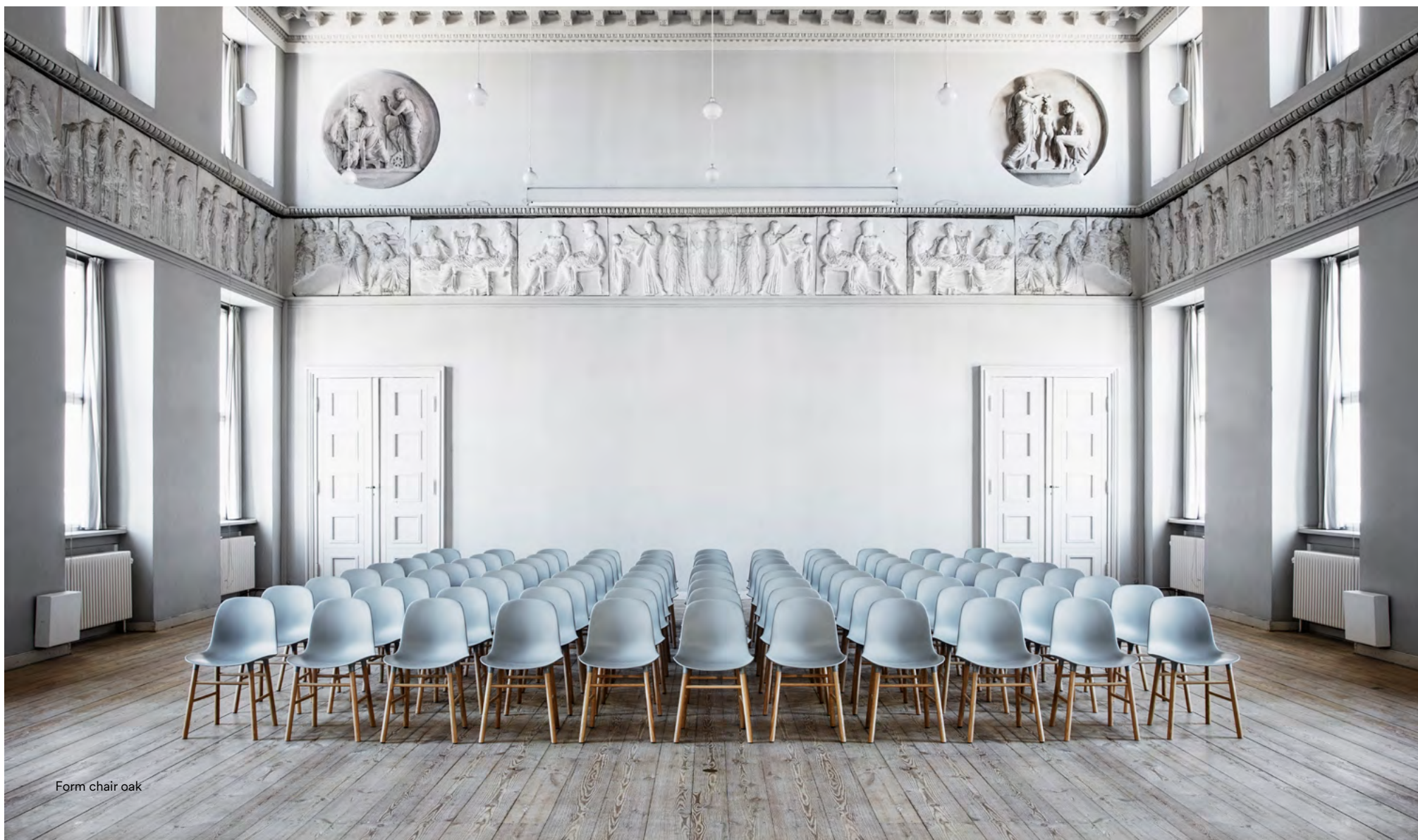
Form chair oak