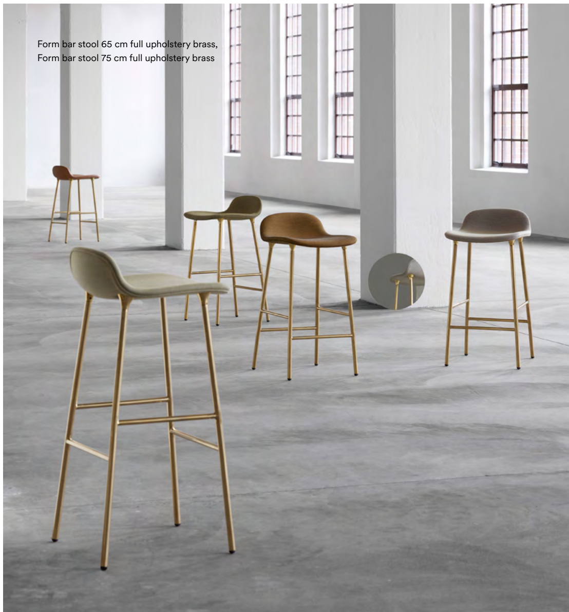
Form bar stool 65 cm full upholstery brass, Form bar stool 75 cm full upholstery brass