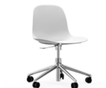
Form chair swivel 5W gaslift H: 73/86 x L: 60 x D: 52 x SH: 37/50 cm