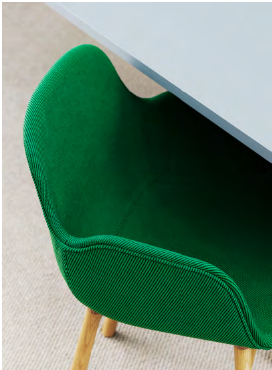
Form armchair full upholstery oak