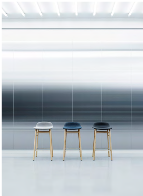
Form bar stool 65 cm full upholstery oak