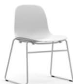
Form chair stacking steel, chrome H: 80 x L: 58,5 x D: 52 x SH: 44 cm