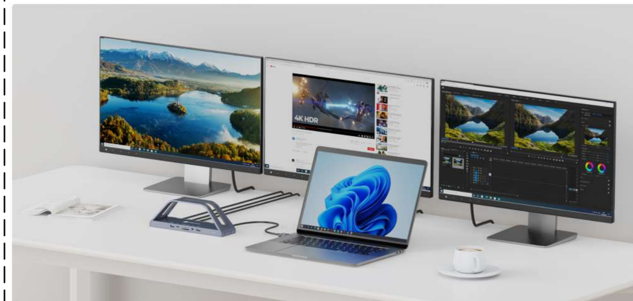
HDMI 1 + HDMI 2 + VGA