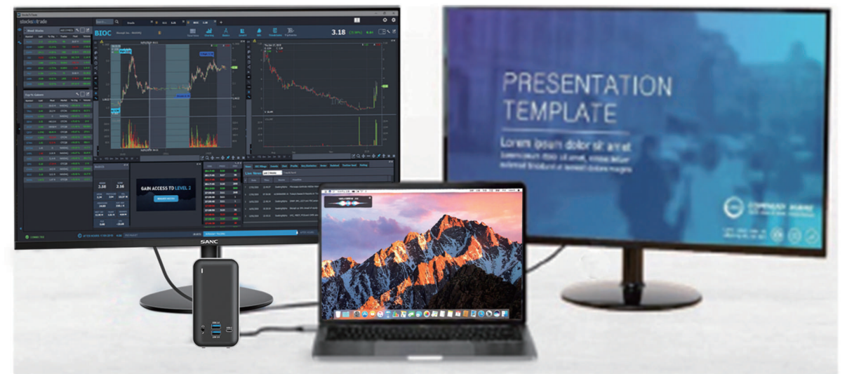
HDMI1 + HDMI2

Step 4: Attach USB 3.0 and USB-C devices(USB driver, keyboard, mouse, printer etc.) to the USB ports on both the front and back of the dock(③④⑥⑦), Insert SD card, TF/Micro SD card into SD/TF slot(⑤)