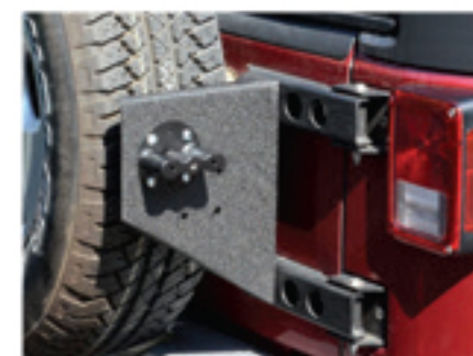
JK ROTOPAX CARRIER