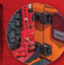
Offroad Jack Hinge Mount (JP54-010)