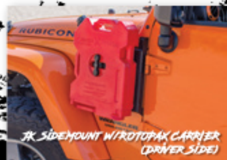
JK SIDE MOUNT W/ROTOPAX CARRIER (DRIVER SIDE)