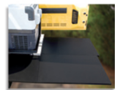
FOLD OUT COUNTER