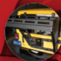
Overland Rack (JP54-035)