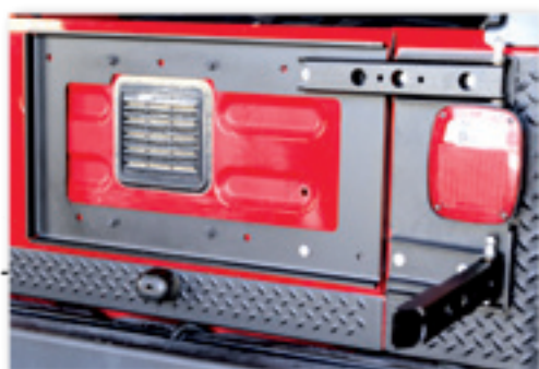
TJ HEAVY-DUTY TAILGATE REINFORCEMENT & HEAVY-DUTY TAILGATE HINGES