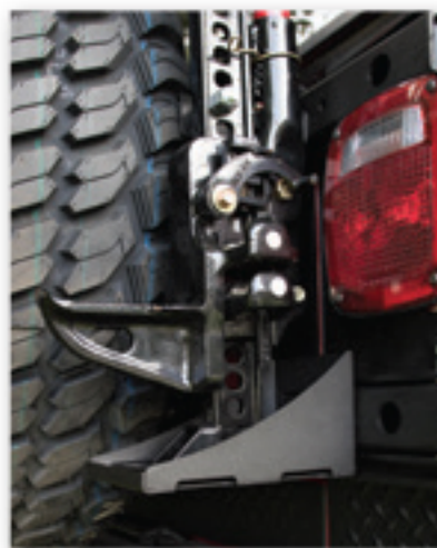
TJ OFFROAD JACK CARRIER