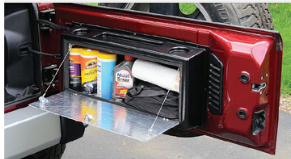
HARD COVER DOOR

Like all vehicles — big or small — space seems to be an issue. Every square inch is packed with your air fresheners, your kid's toys, your spare change, your car jack, and of course, your prized collection of fast-food receipts. Fortunately, we came up with our very own trunk storage solution to give you added space for whatever the need.