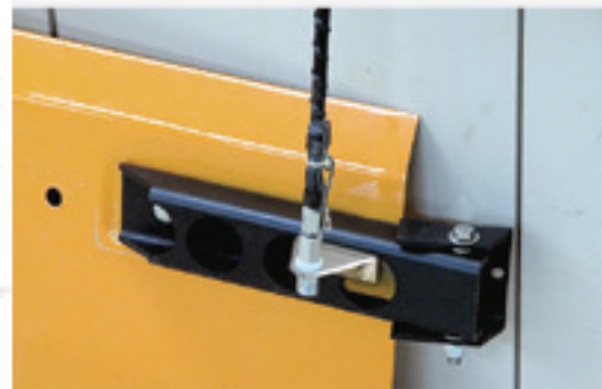
JK CB ANTENNA MOUNT