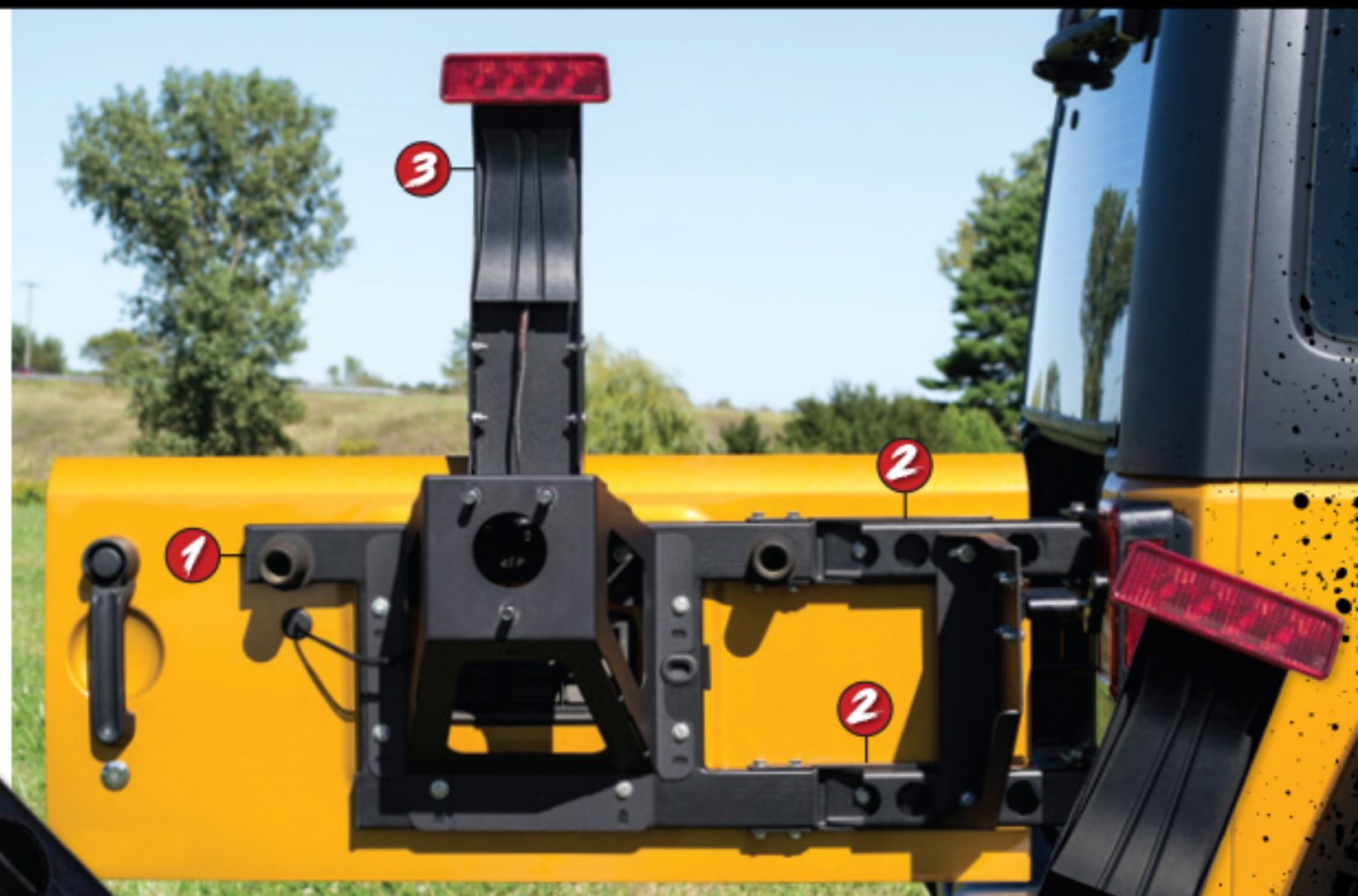
JP54-021 – JK Tailgate Reinforcement Kit

A substantial upgrade over factory hinges with added strength and hardcore styling. This durable tailgate hinge set makes upgrading your weak factory hinges a simple and painless process.