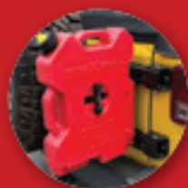
Rotopax Hinge Mount (JP54-012)

Rock, mud, sand, or stream – no landscape is too rugged for your Jeep Wrangler, but after a few legendary adventures, your factory equipment may not stand up to all that fun. The combination of MORryde's Heavy-Duty Tailgate Hinges, Tailgate Reinforcement, and Spare Tire Carrier offers unparalleled strength and durability so when your next great adventure calls, you and your Wrangler will both be ready.