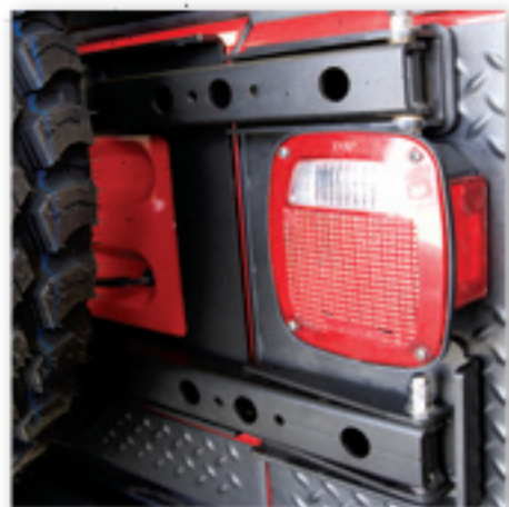
TJ TAILGATE HINGES