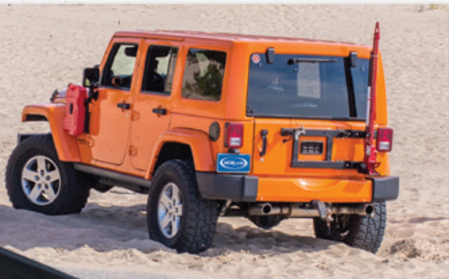
JK HEAVY-DUTY TAILGATE REINFORCEMENT & OFFROAD JACK CARRIER

Everyone wants larger, more aggressive tires on their Jeep, but the factory tailgate isn't up to the task of carrying heavier spares. Carrying a heavier spare on the stock tailgate can cause the tailgate welds to break and the hinges to weaken, sag, and rattle. The Heavy-Duty Tailgate Reinforcement eliminates weak points in the factory tailgate and hinge system. No more risk of broken tailgate welds or prematurely worn hinges.