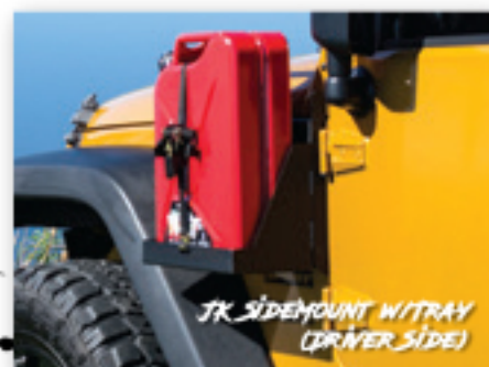
JK SIDE MOUNT W/TRAY (DRIVER SIDE)