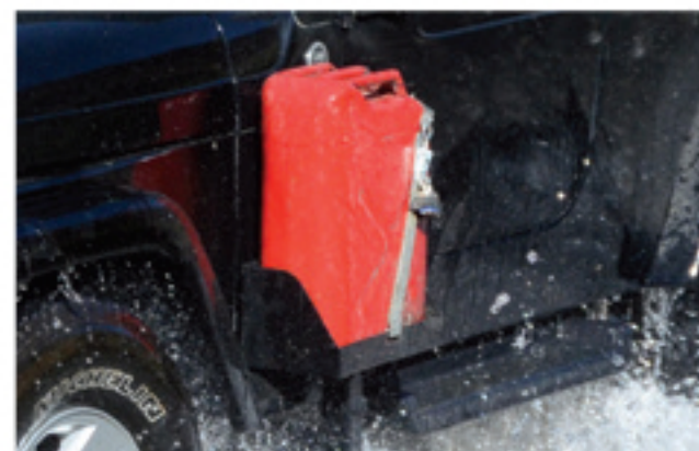
TJ SIDE MOUNT W/TALL TRAY