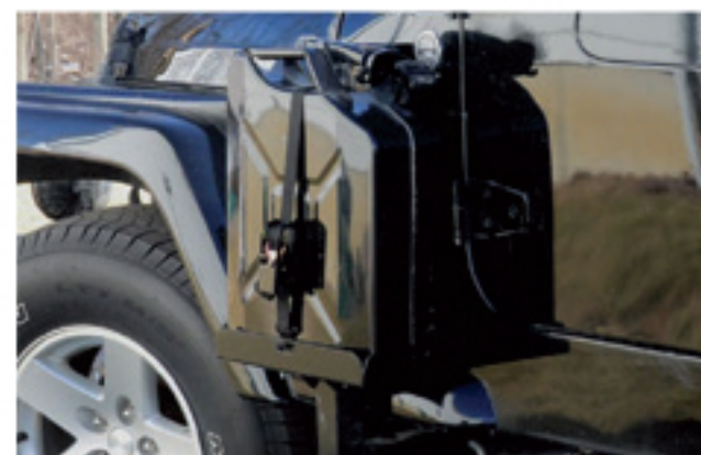
TJ SIDE MOUNT W/SHORT TRAY