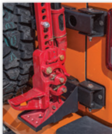
JK OFFROAD JACK CARRIER