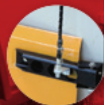
CB Antenna Hinge Mount (JP54-009)