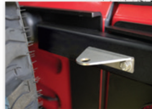
TJ CB ANTENNA MOUNT