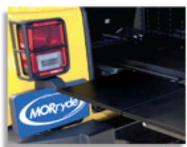
CLIP ON COUNTER