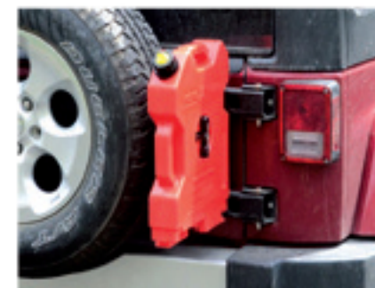
JK ROTOPAX CARRIER W/ FUEL