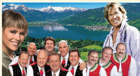
Stars of the Austrian Folk Music Fest in Zell am See

After breakfast, visit the traditional Farmers Market with entertainment in the center of Zell am See. At the various market stands, purchase and sample traditional delights such as homemade bread or cheese, smoked bacon, and of course locally made Schnapps. At noon, our bus will take us to the Liechtenstein Klamm, one of the deepest, longest, and most beautiful gorges in the Alps. Listen to the roaring waterfall and enjoy the rainbows wherever the sun touches the fine mist in the air. Return to our hotel for a farewell dinner before heading back to the Ice Stadium for the finale of the Alpine Music Fest, featuring Hansi Hinterseer, Austria's top folk music star, and various popular music bands. BD