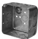
4" square deep steel box 4" x 4" x 2-1/8" (102mm x 102mm x 54mm)