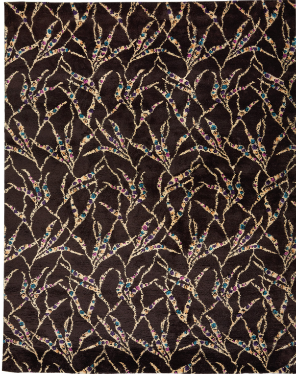
8x10 ft size (not to scale)

LEAD TIME Made to Order – Approx 12–14 weeks