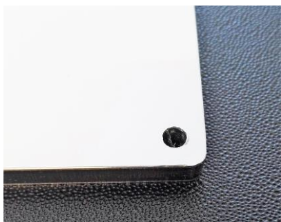
Mounting guide hole on the backside of the A1030.

These holes can be drilled through without damaging the product or interfering with the performance.