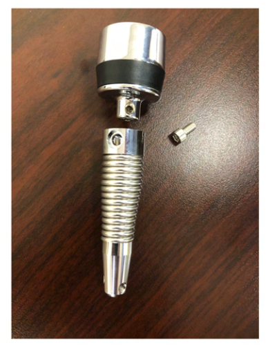
STEP 2: Attach spring to the NMO base by using the large hex screw and large hex wrench (photo # 1-3)

STEP 1: Remove rod, base, spring and hardware from packaging.