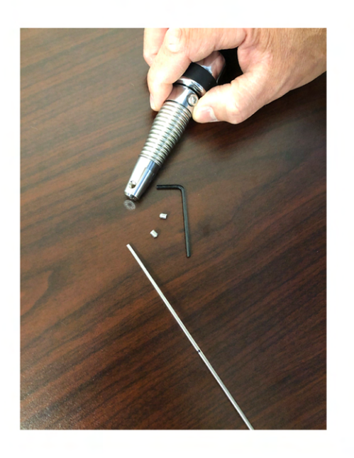
STEP 4: Insert rod into the top of the spring and secure with two of the small threaded studs with the small hex wrench (photo # 5-7)