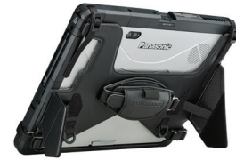
(tablet sold separately)

(Not compatible with any tablet dock that has a tablet with a quick-release SSD or with Gamber-Johnson Tablet Vehicle Dock when tablet is equipped with long life batteries)