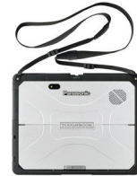
(tablet sold separately)