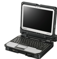
(tablet sold separately)

(VDA fits in any Gamber-Johnson/Havis 31 Vehicle Dock)