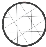
Type 450481A Moledisc Diffuser Frame