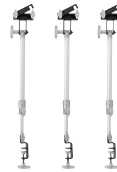
Type 635187 Extension Arm (Set of 3)