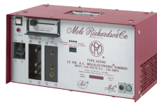
Type 42590 12K A.C. DMX Molelectronic Dimmer (120V)