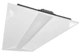
T4A Architectural LED Troffers