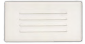
15811 Louvered Cover