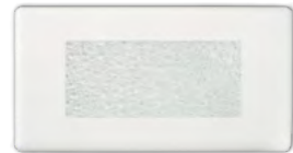
15812 Textured Glass Cover