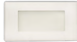
15810 Glass Cover