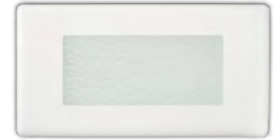
15813 Textured Frosted Glass Cover