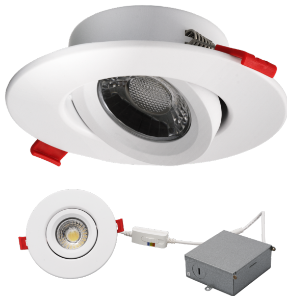
DGC4 9W LED Recessed Gimbal