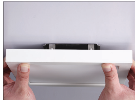
Snap Blink onto the mounting plate.