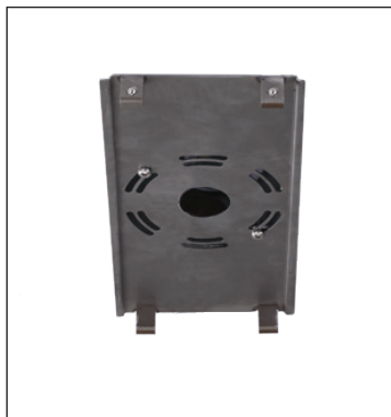
Simply screw the Blink universal mounting plate to the junction box.