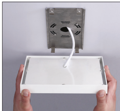
Make your connections using the quick connect included, and lift into place.