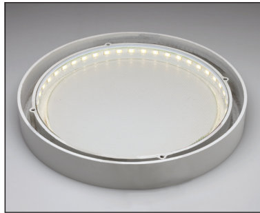
Edge-lit design eliminates hot spots and provides even light output