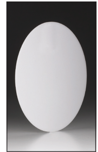
Laminated light guide assembly for consistent light dispersion, (glass, pattern disk and diffuser)