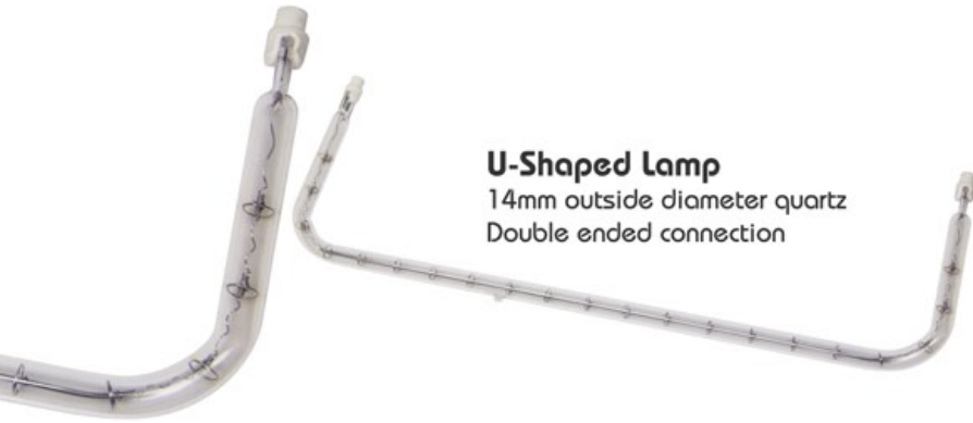
U-Shaped Lamp 14mm outside diameter quartz Double ended connection

USHIO Quartz Infrared Heater lamp creates clean, safe heat source which can be flexibly controlled and minimizes footprint to maximize design possibilities. Contact USHIO at 800.838.7446 for your custom lamp design.