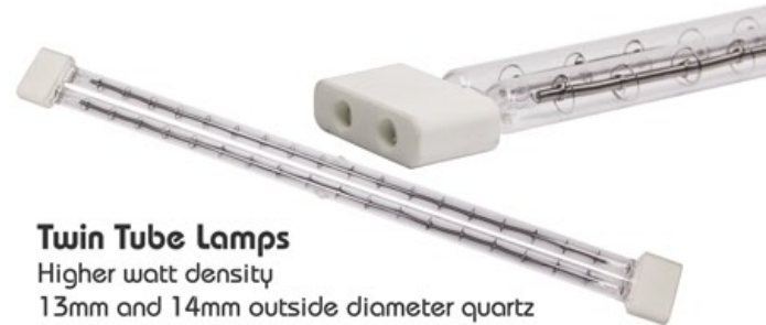
Twin Tube Lamps Higher watt density 13mm and 14mm outside diameter quartz Available in single and double ended configurations