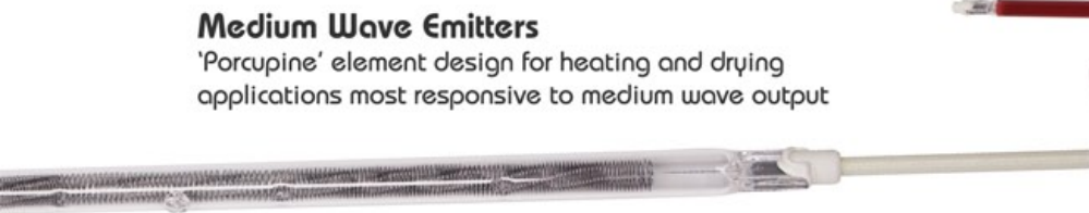
Medium Wave Emitters 'Porcupine' element design for heating and drying applications most responsive to medium wave output