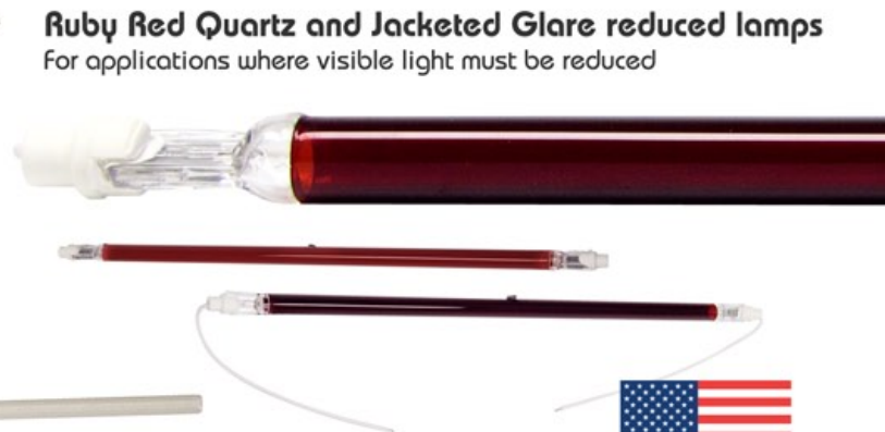
Ruby Red Quartz and Jacketed Glare reduced lamps For applications where visible light must be reduced