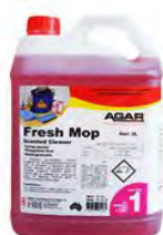
Agar Fresh Mop Floor Cleaner