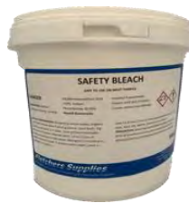
Fletchers Safety Bleach Powder