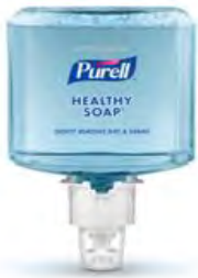
Purell 5077 ES4 Fresh Scent Foam