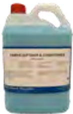
Fletchers Fabric Softener & Conditioner