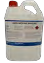
Fletchers Alcohol Hand Rub

Code 00317 Alcohol 70% Capacity 5lt Price $55.12