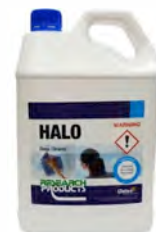
Research Halo Window Cleaner