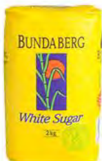
Bundaberg White Sugar