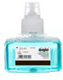
Gojo 1316 LTX Fresh Berry Foam