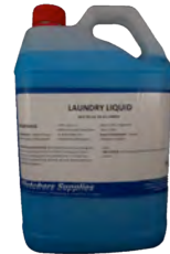
Fletchers Laundry Liquid