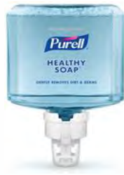
Purell 7777 ES8 Fresh Scent Foam