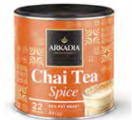
Arkadia Chai Tea Spice