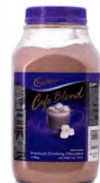
Cadbury Drink Chocolate Cafe Blend