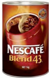
Nescafe Cofee Blend 43