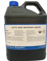
Fletchers Auto Dishwasher Liquid