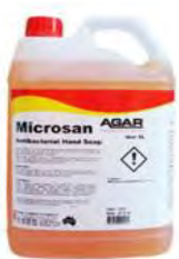
Agar Microsan Anti Bacterial

Cleansing agent designed to work with water to remove dirt, oils and grease.