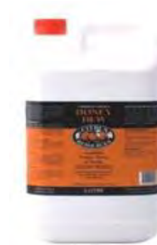
Citrus Resources Organic Honey Dew