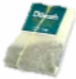
Dilmah Tea Bags