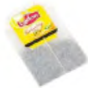
Lipton Tea Bags