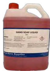
Fletchers Rose Soap