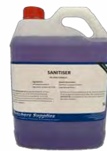
Fletchers Food Service No Rinse Sanitiser