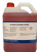
Fletchers Pine Floor Cleaner