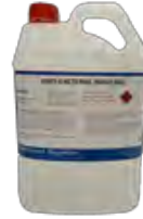
Fletchers Anti-Bacterial Gel

Code 12324 Alcohol 70% Capacity 350ml Price $13.78