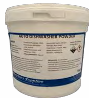
Fletchers Auto Dishwasher Powder