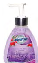
Northfork Lavender & Rosehip