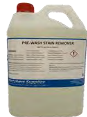
Fletchers Pre Wash Stain Remover