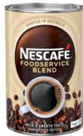
Nescafe Granulated Food Service