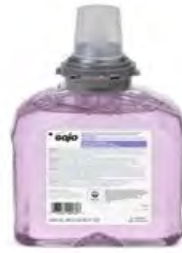
Gojo 5361 TFX Premium Foam