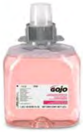
Gojo 5161 FMX Luxury Foam

Foam Soap cartridges to suit the Gojo / Purell manual and automatic wall dispensers.