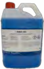
Fletchers Rinse Aid