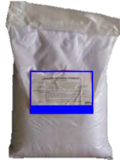
Fletchers Laundry Powder Eucalyptus, Bag