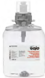
Gojo 5122 FMX Anti-Bac Foam