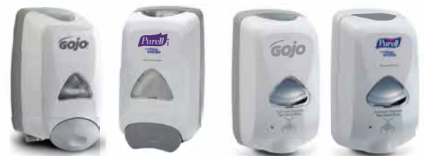
Purell ES4/ES8 Sanitiser or Soap