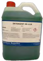
Fletchers Dish De-Lux Detergent

Chemicals suitable for the kitchen area, including Dishwashing, Sanitising, Floor and Window detergents.