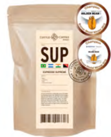
Cottle Coffee Supreme Whole Beans