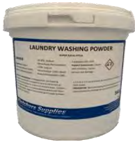
Fletchers Laundry Powder Eucalyptus, Pail

Laundry chemicals including, Laundry Washing, Fabric Softener & Conditioner, Safety Bleach and Stain Remover.