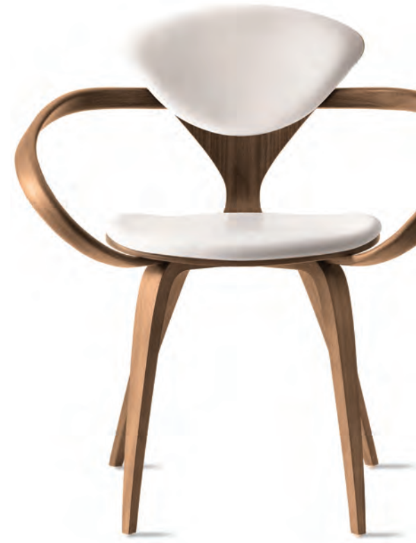
Seat and Back Pads