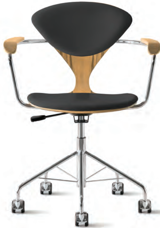
Seat and Back Pads