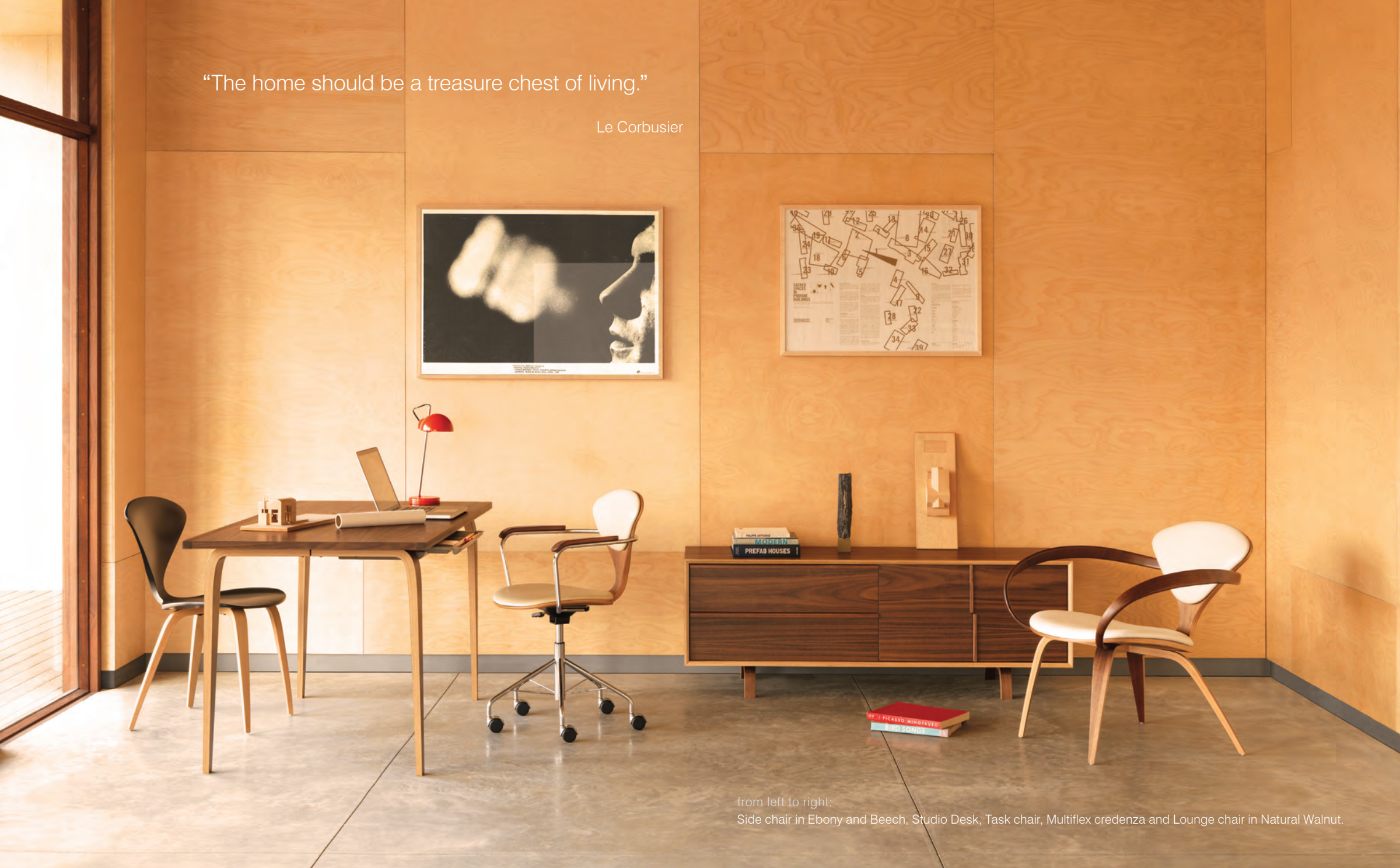
from left to right: Side chair in Ebony and Beech, Studio Desk, Task chair, Multiflex credenza and Lounge chair in Natural Walnut.