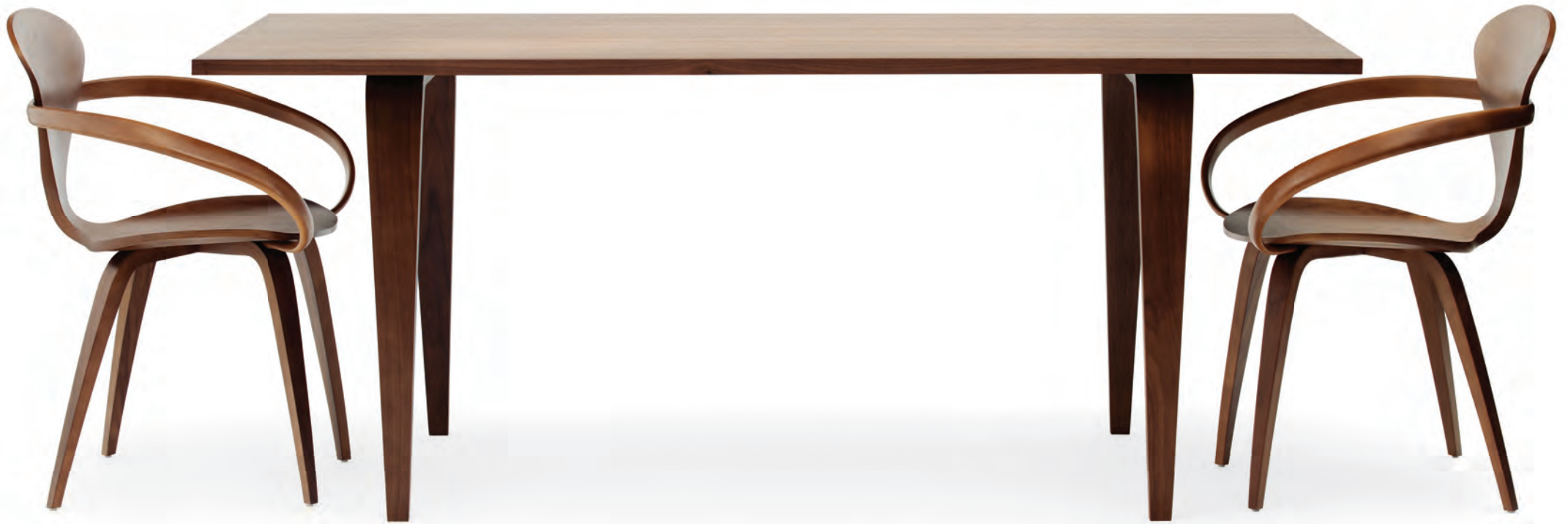
72" x 34" Classic Walnut