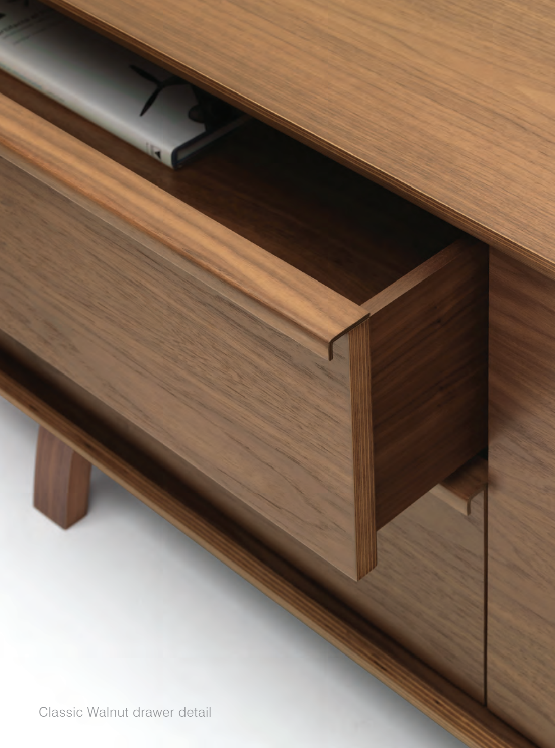
Classic Walnut drawer detail