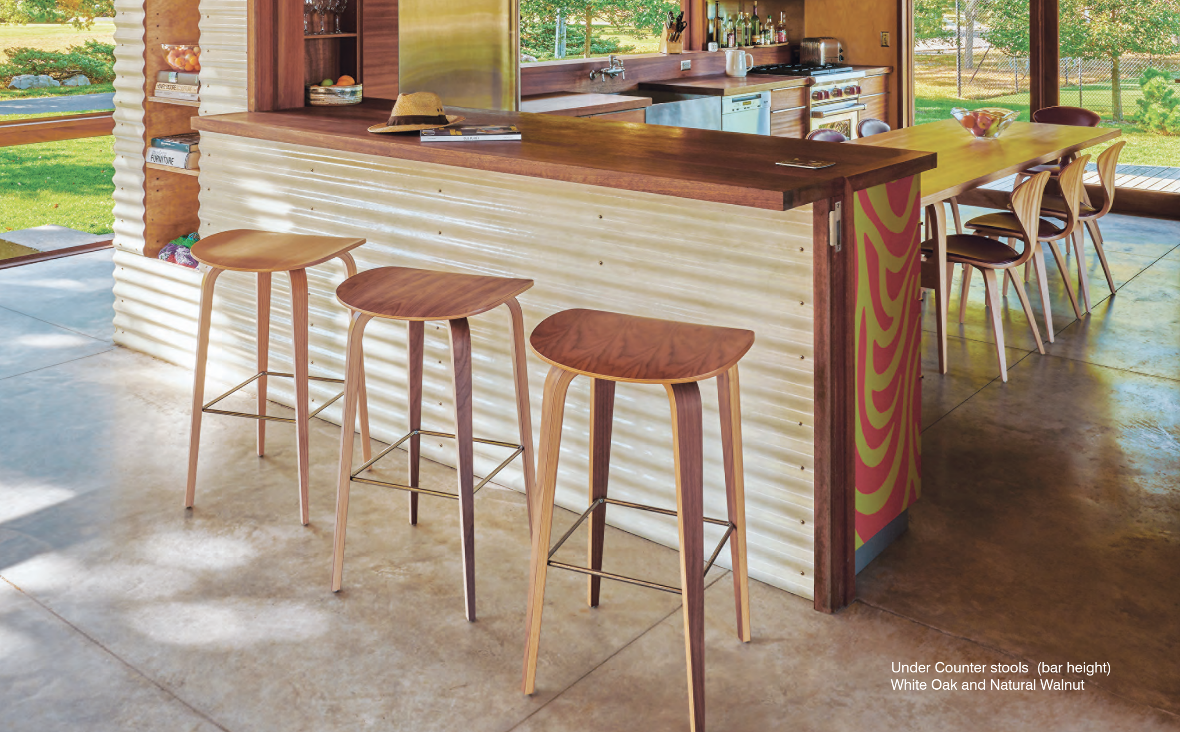
Under Counter stools (bar height) White Oak and Natural Walnut