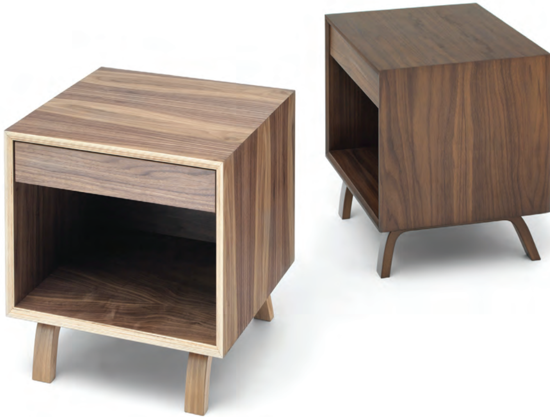
from left to right: Natural Walnut, Classic Walnut

Perfectly scaled beside storage with a single drawer. The new Bedside Tables are built entirely from laminated, molded and cross-ply plywood. American Walnut veneers and contrasting edge laminations create a strong geometry and highlight the handcrafted mitered joinery. Cherner Bedside tables are sustainably made in the U.S.A.