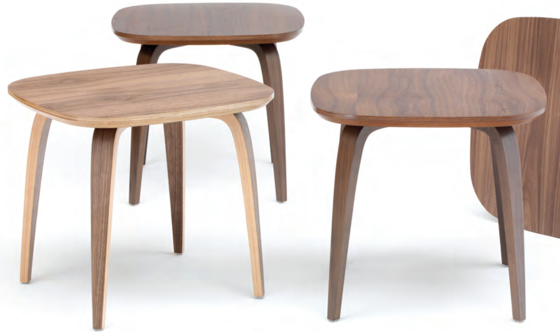
from left to right: Natural Walnut, Classic Walnut

The new Side Table is a versatile small scale table for living, bedroom or lounge areas. The veneered top is made of 1-1/8" thick cross-ply plywood with an exposed profiled edge. The legs are laminated wood with an exposed edge. Cherner Side tables are sustainably made in the U.S.A.