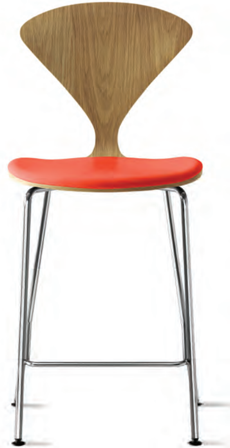
Seat Pad only