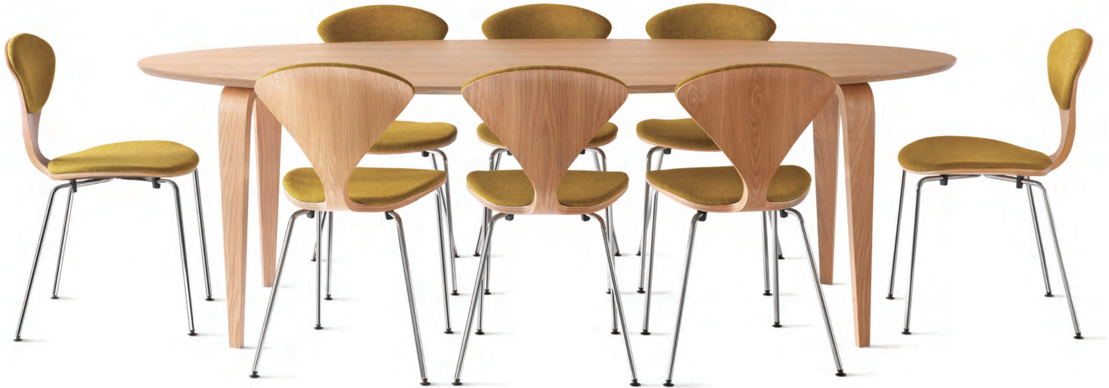
38" x 92" Natural White Oak Oval Table