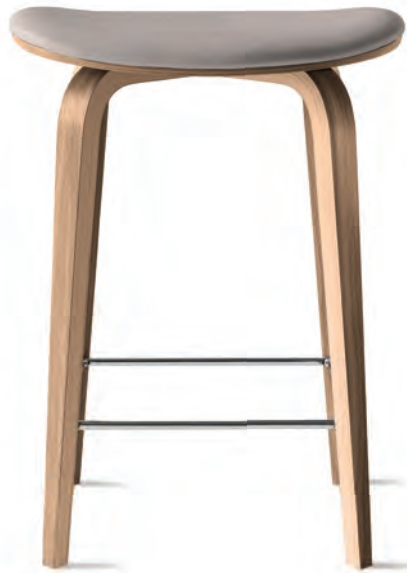
Seat Pad only