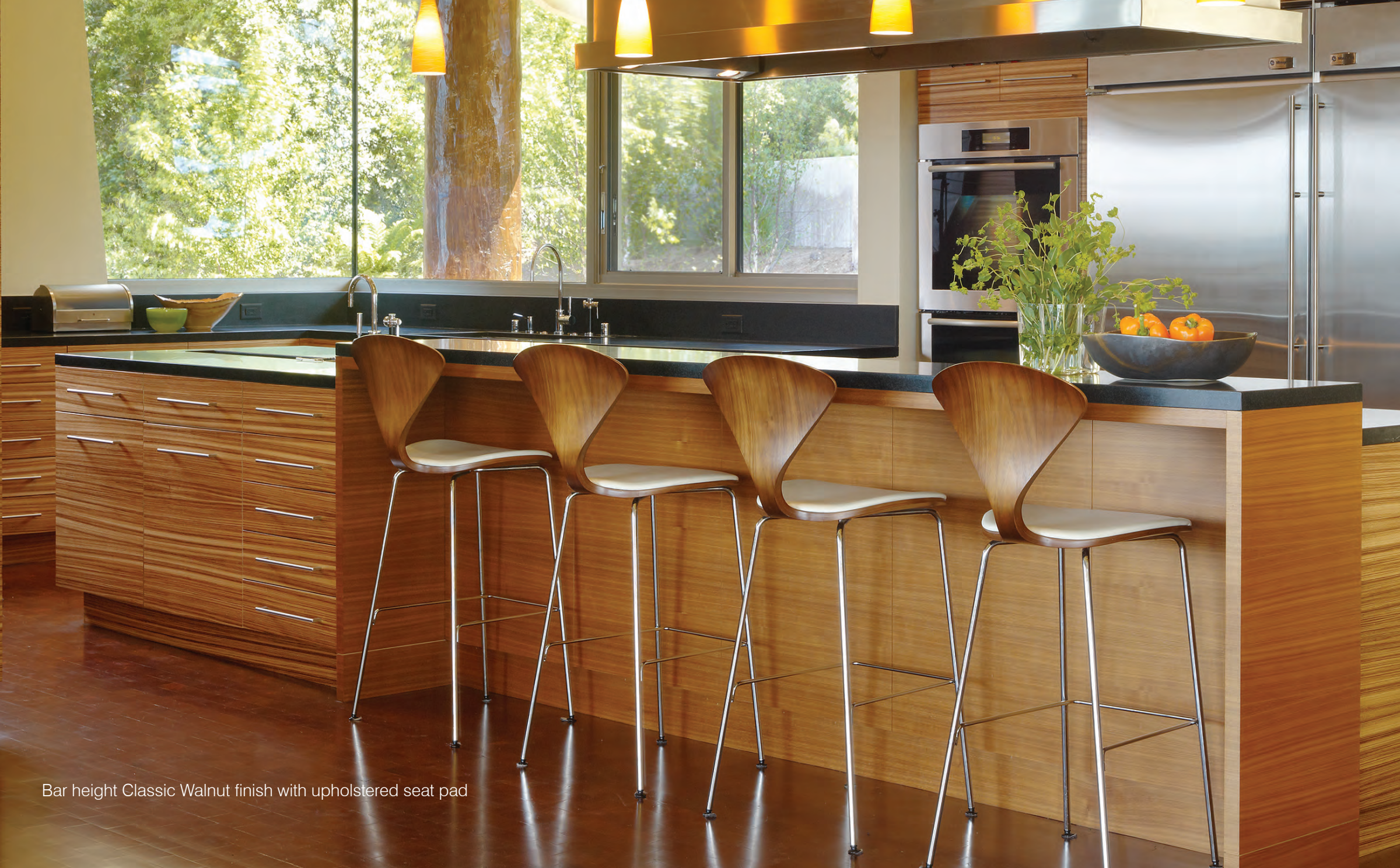
Bar height Classic Walnut finish with upholstered seat pad