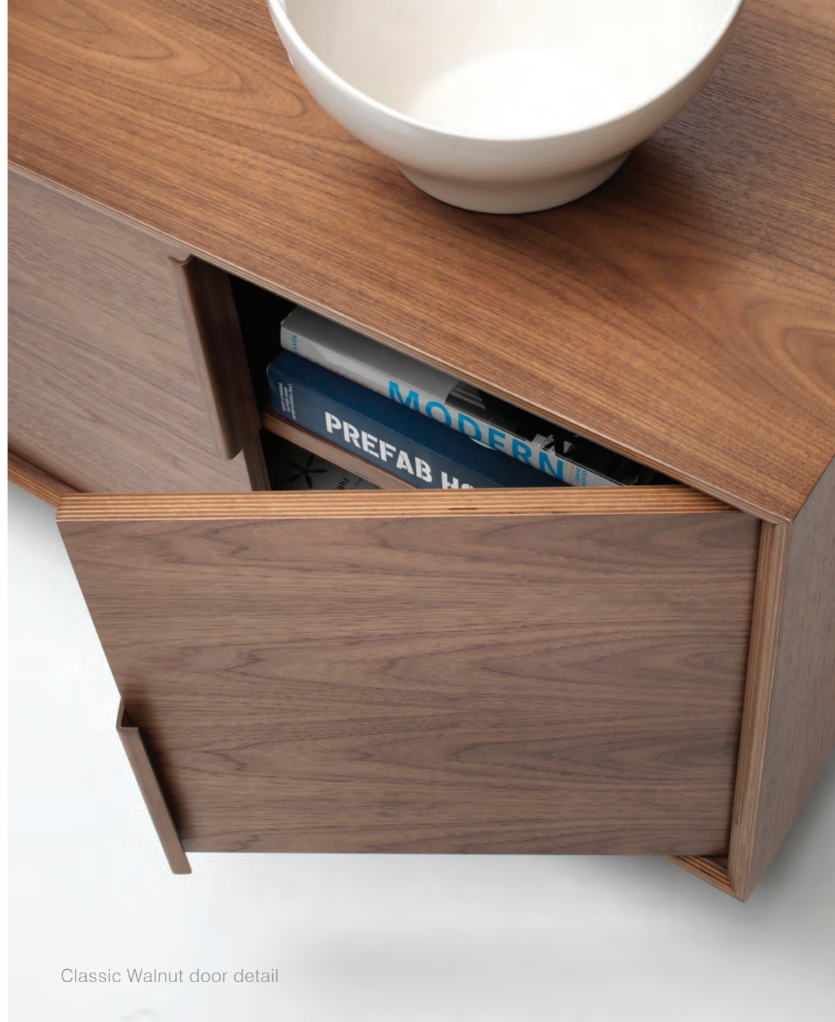
Classic Walnut door detail