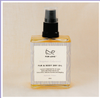
FUR & BODY OIL