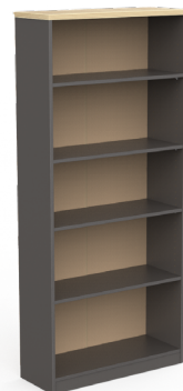
Locker - 6 Door 1800h x 800w x 300d