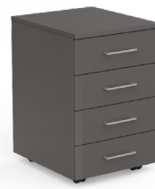
4 Drawer Mobile 600h x 400w x 460d