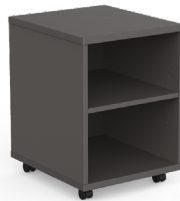
Mobile Bookcase 600h x 440w x 500d