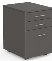
2 Drawer + File Mobile 600h x 400w x 500d