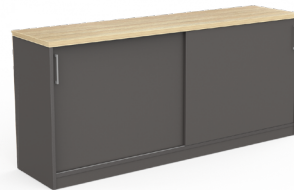
Bookshelf - 5 Level 720h x 1600w x 400d