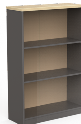
Locker - 6 Door 1200h x 800w x 300d