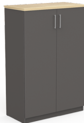
Cupboard - 3 Level 1200h x 800w x 400d