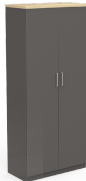
Cupboard - 5 Level 1800h x 800w x 400d