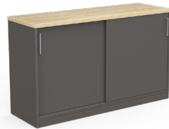
Bookshelf - 3 Level 720h x 1200w x 400d