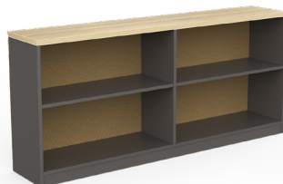
Locker - 3 Door 720h x 1600w x 300d