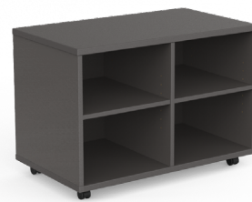
Mobile Bookcase 600h x 858w x 500d