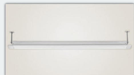
39" threaded rod (M10 - 1.5mm) included for standard in-ceiling installation.

Note: The most common sizes and aspects are listed here. Visit severtsonscreens.com/model/SE or contact a sales representative for more available sizes and specifications.