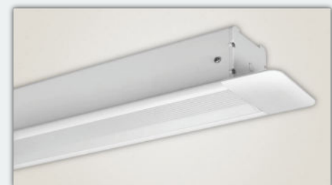
Spirit Series retracts flush into the case while not in use.