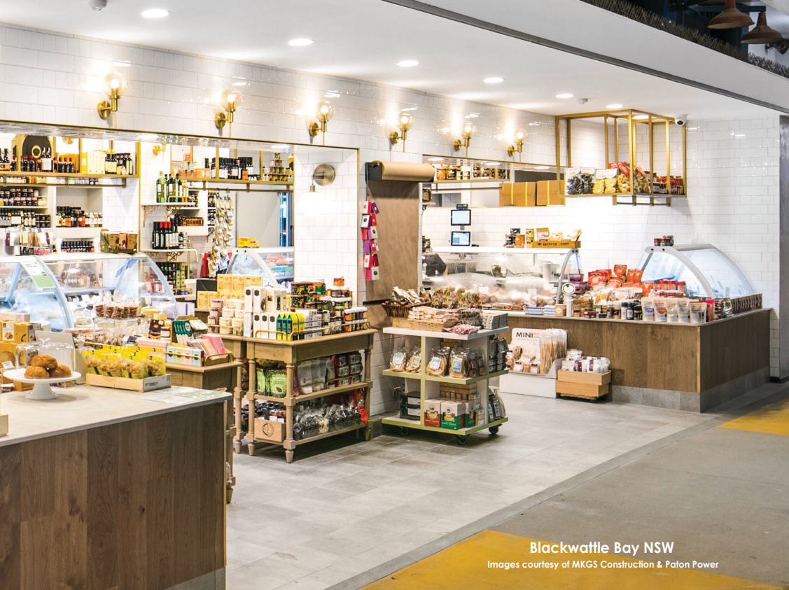
Blackwattle Bay NSW