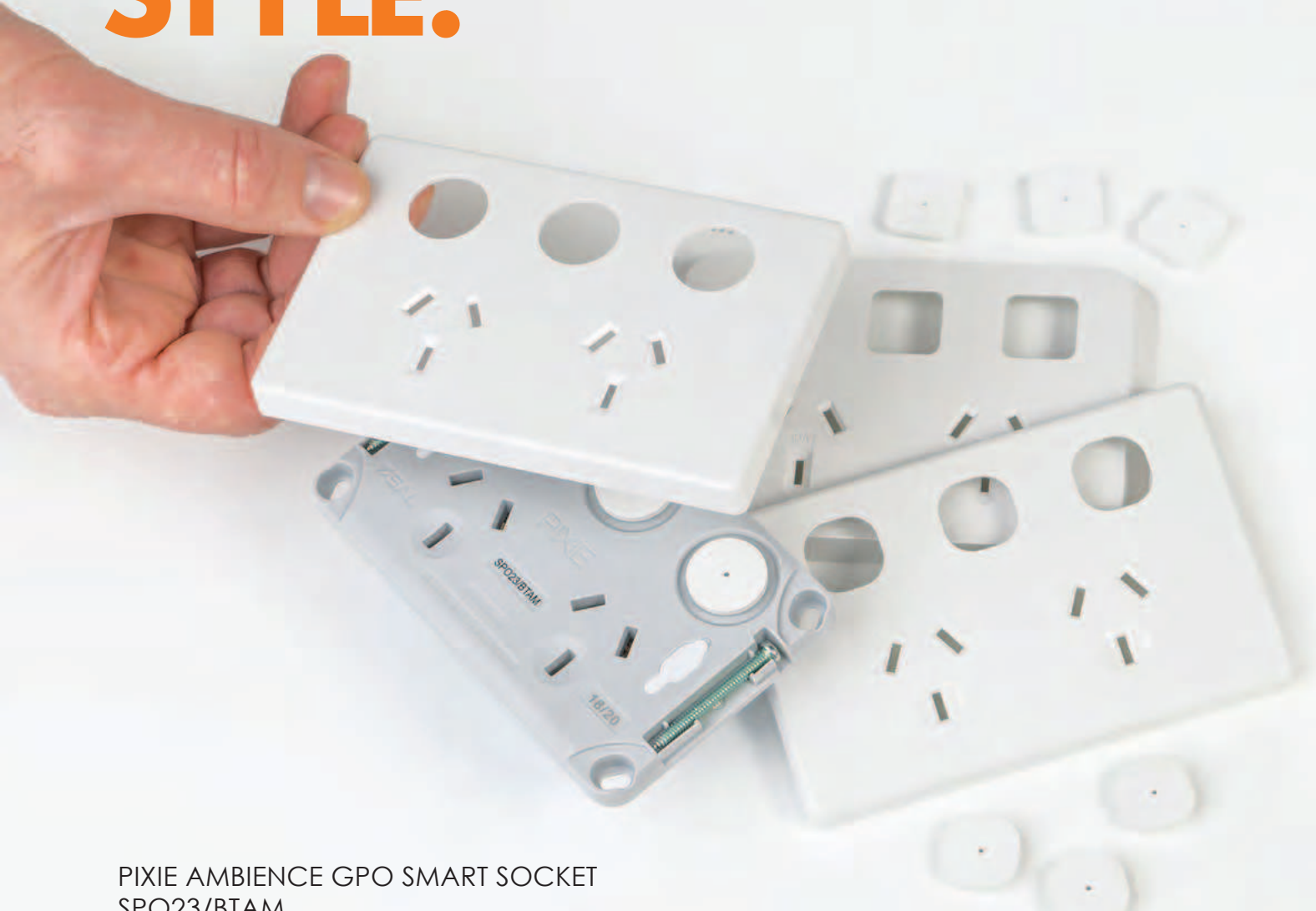
PIXIE AMBIENCE GPO SMART SOCKET SPO23/BTAM