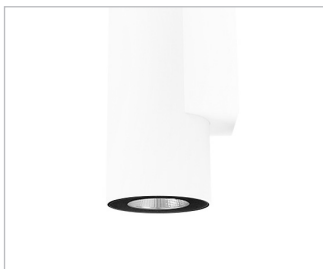
W White Trim