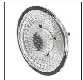
Additional 60° lens is included in the package