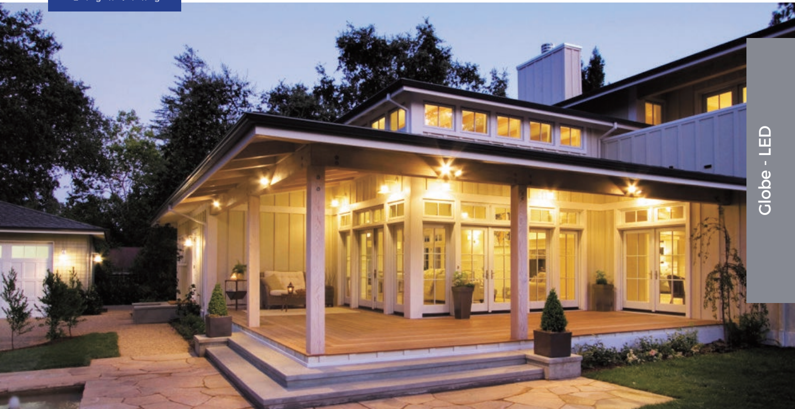
Globe - LED