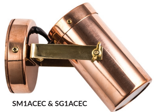
SM1ACEC & SG1ACEC