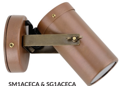
SM1ACECA & SG1ACECA