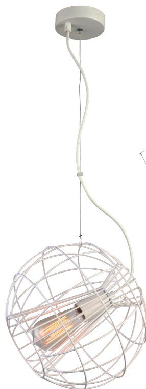
SENTINEL2 (Matt White)