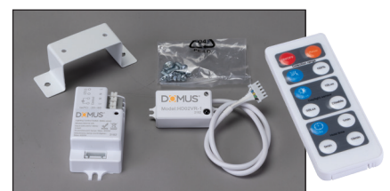
Internal ON/Off Sensor