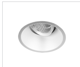
S Silver Trim