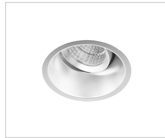
S Silver Trim