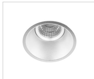
S Silver Trim