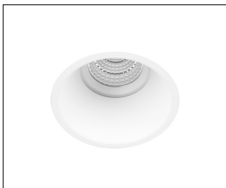
W White Trim