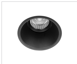
B Black Trim