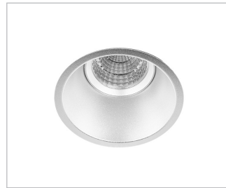
S Silver Trim