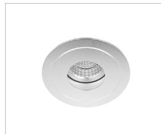
S Silver Trim