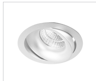
S Silver Trim