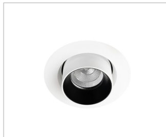
BI Black Insert