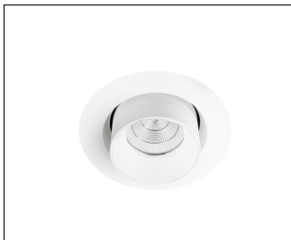
WI White Insert