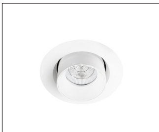
W White Trim