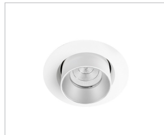
SI Silver Insert