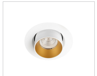
GI Gold Insert