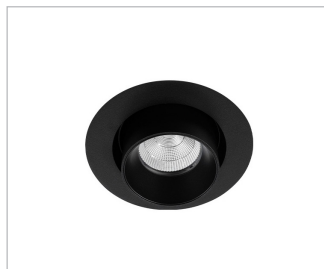
B Black Trim