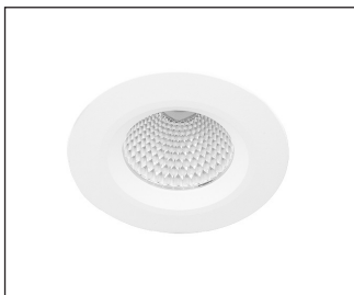
W White Trim