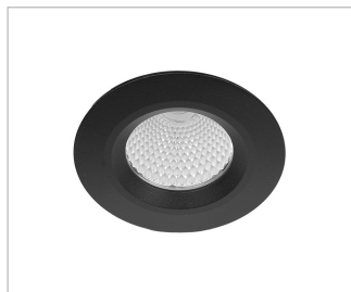
B Black Trim