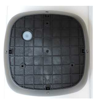
Onboard Inbuilt Driver