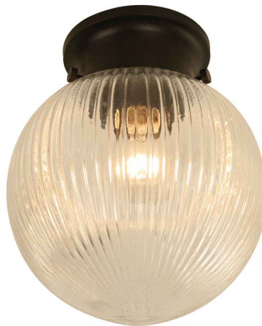
DIYBAT09 (Black / Clear Glass)