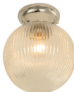
DIYBAT10 (Chrome / Clear Glass)