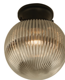
DIYBAT11 (Black / Smoky Glass)