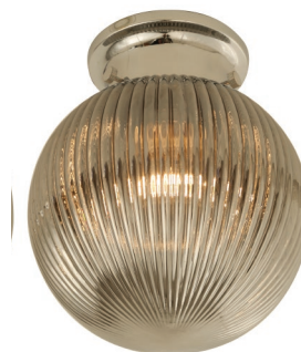
DIYBAT12 (Chrome / Smoky Glass)