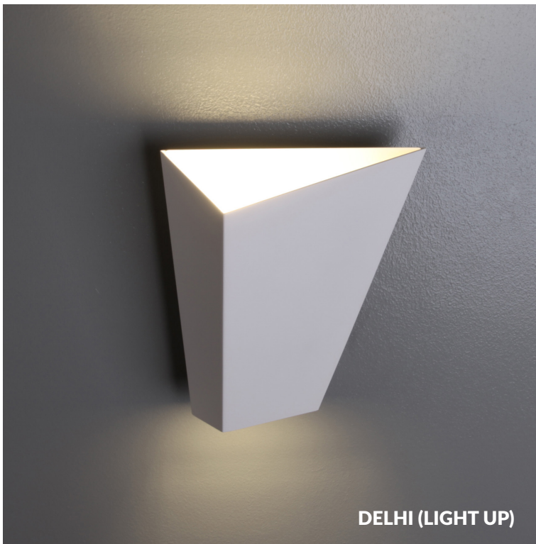
DELHI (LIGHT UP)