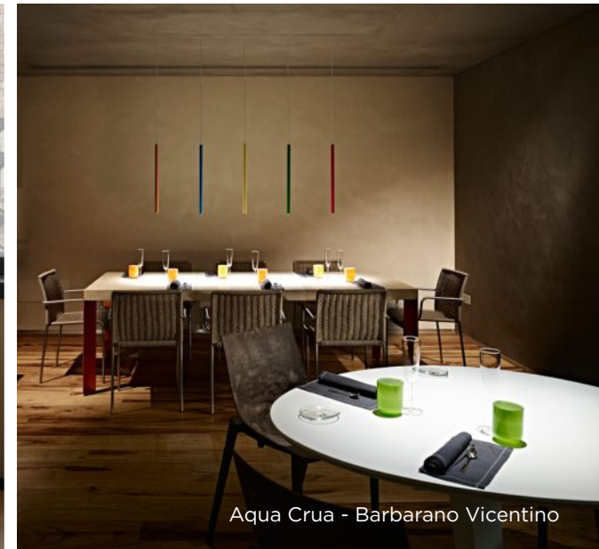
Aqua Crua - Barbarano Vicentino