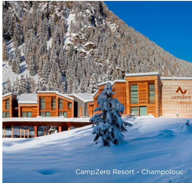
CampZero Resort - Champolouc