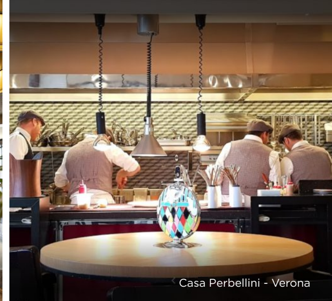
Casa Perbellini - Verona