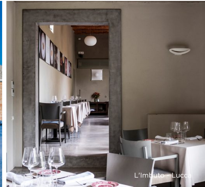
L'Imbuto - Lucca