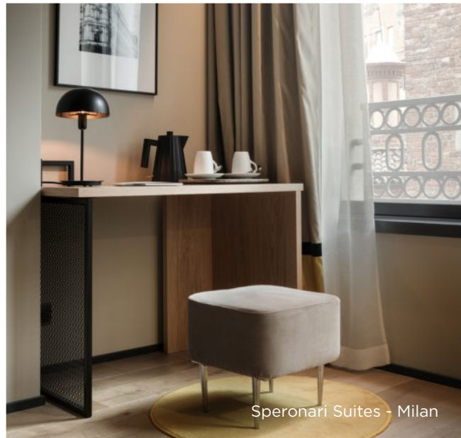
Speronari Suites - Milan