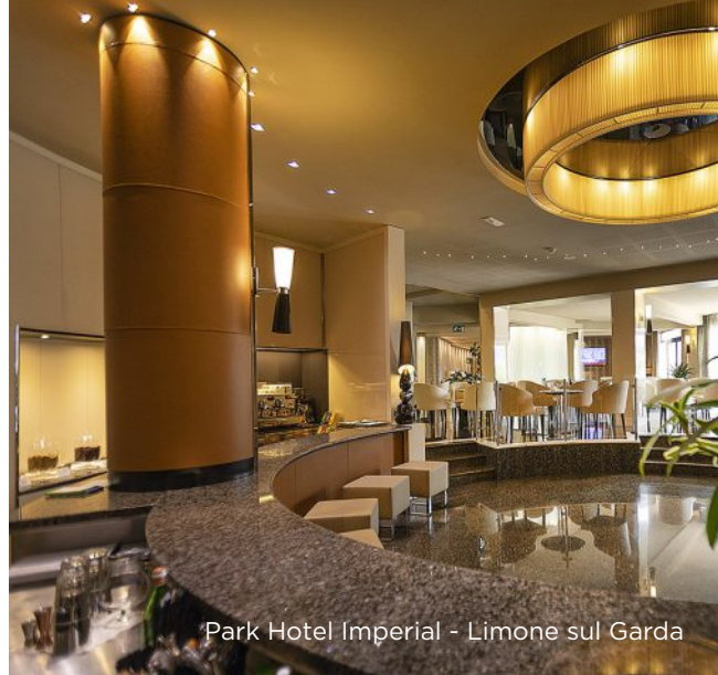
Park Hotel Imperial - Limone sul Garda

Larte Restaurant Dubai - UAE Lords of Verona Apartments - Verona Lungarno Collection Hotels - Florence / Rome Mandarin Oriental Hotel Lago di Como - Blevio (CO) Mandarin Oriental Hotel Milan - Milan Costa Smeralda - Costa Crociere Group - Genoa Omega Boutiques Palazzo di Varignana Resort & SPA - Castel S. Pietro Terme (BO) Palazzo Segreti Hotel - Milan Palazzo Vendramin-Costa Apartments - Venice Panerai Boutiques Park Hotel Imperial - Limone sul Garda (BS) Raffles Europejski Warsaw - Poland Ristorante 12 Apostoli - Verona Ristorante Aqua Crua - Barbarano Vicentino (VI) Ristorante Casa Perbellini - Verona Ristorante Le Calandre - Sarmeola di Rubano (PD) Ristorante L'Imbuto - Lucca Ristorante Lume - Milan Ristorante Quadri - Venice Rocco Forte Hotel de la Ville - Rome Rocco Forte Hotel Savoy - Florence Royal Champagne Hotel & SPA - Champillon - France Sanlorenzo Yachts Senato Hotel - Milan Speronari Suites - Milan The Central Tower Apartments - Milan