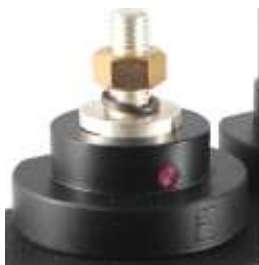
M12 Cable Lugs