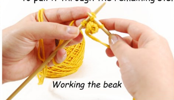
Working the beak

Cut your yarn and use a tapestry needle to pull it through the remaining sts.