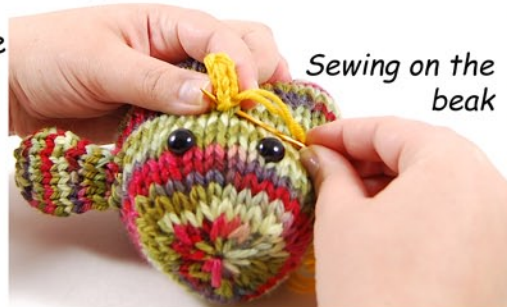
Sewing on the beak

Stick the beak in the middle of the face, and carefully stitch around the base to sew it down (again, I use a whip stitch). If you haven't done so already, embroider the eyes. Send someone a text message, you are done!