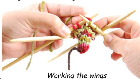
Working the wings

Stuff your birdie now and add the safety eyes (and a rattle insert if you want). Cut your yarn and use a tapestry needle to pull it through the remaining sts.