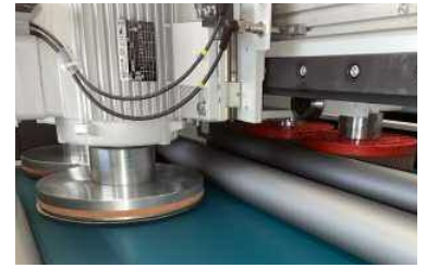
Four rotating discs with full-width oscillation for uniform 360° processing

Costs: This "disc only" concept makes it possible to dispense with expensive vacuum or magnetic hold down features and thus allows the machine to be priced competitively. Low energy consumption and inexpensive abrasive costs ensure a speedy return on investment.