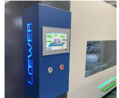
Touch panel control (optional)