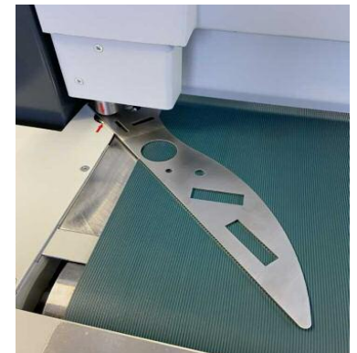
Motorized height adjustment, automatic setting of thickness using a limit switch (optional)