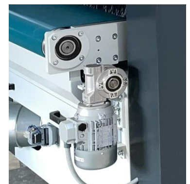
Rotating cleaning brush for feed belt (optional)